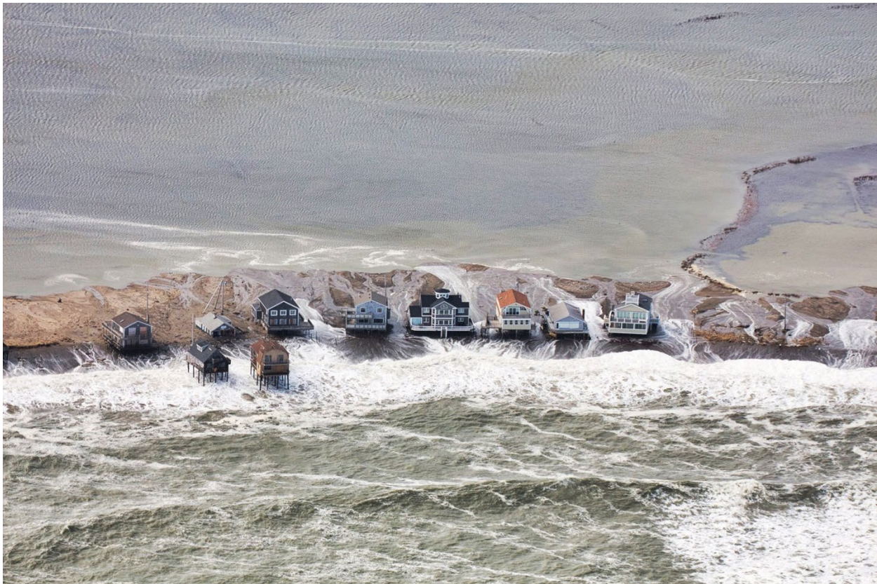
Fig. 2 – Coastal flooding in Peggotty Beach, Scituate, MA on 04 March