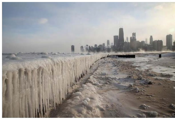
Figure 2: Photograph of Lake Michigan during the height of the arctic intrusion