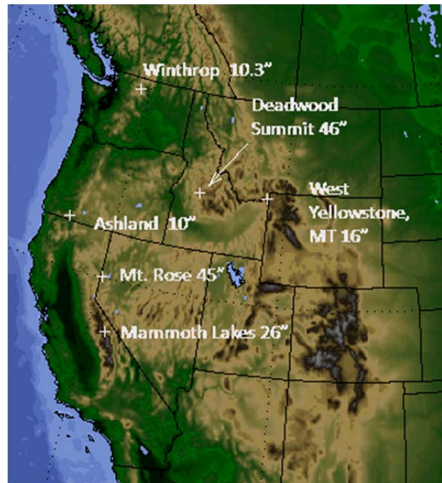
Figure 2. Map of maximum snowfall locations and amounts in each of the affected states.

System #5: Behind system #4, a cool high pressure system built across much of the West, allowing a welcome break in the recent spell of active weather on the 3 rd . However, some light precipitation continued to linger in the Pacific Northwest (fig. 3f). Meanwhile, yet another low pressure system was strengthening in the Pacific midway between the Hawaiian Islands and the West Coast. A distinct plume of high moisture from the subtropics, known as an “atmospheric river” (fig. 1), spread rapidly east-northeastward from the Hawaiian Islands into northern California by late in the afternoon on the 3 rd (fig. 3g). By the evening hours, widespread heavy precipitation inundated western Oregon and western Washington. The intensity of the precipitation began to ease somewhat during the day on December 4.